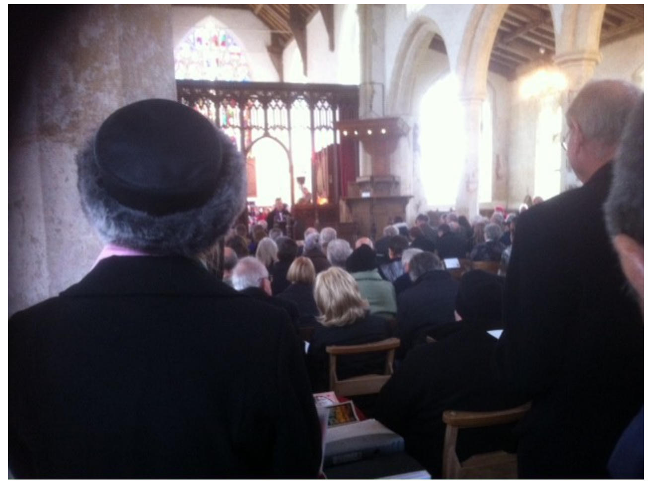
A view from the back of the church which was standing room only.

A well judged service befitting the man who is no longer with us.